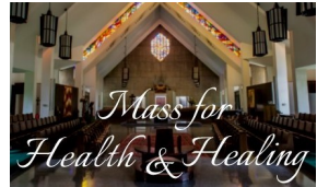
Mass for Health & Healing

There will be no Healing Mass during the months of June, July or August. See you September 5.